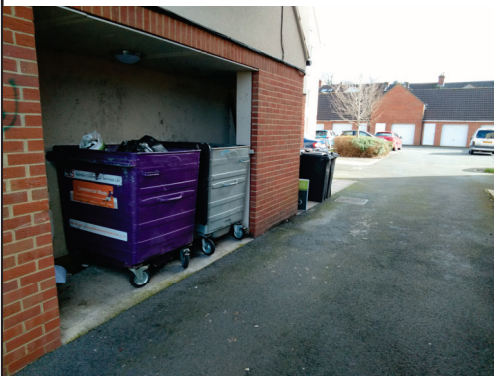
Bin Store (Waste Disposal Area)