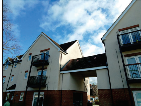
Roofing (Tiles and Cladding)