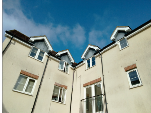
Guttering (Gutters and Fascia)