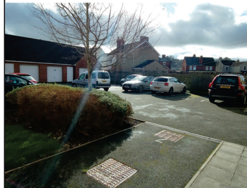
Car Park (Vehicle Parking)