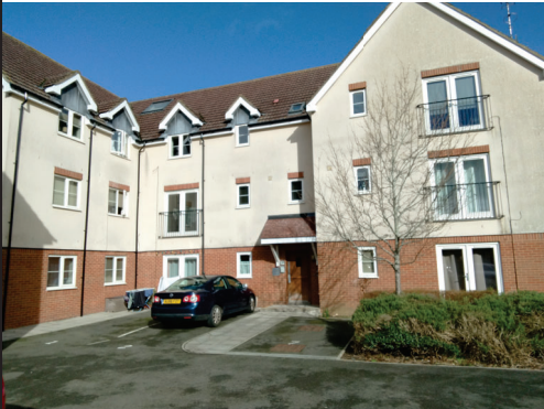
Exterior Structure (The Building)