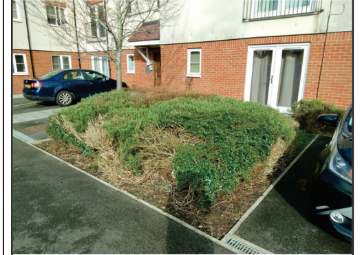
Communal Grounds (Gardens and Common Areas)